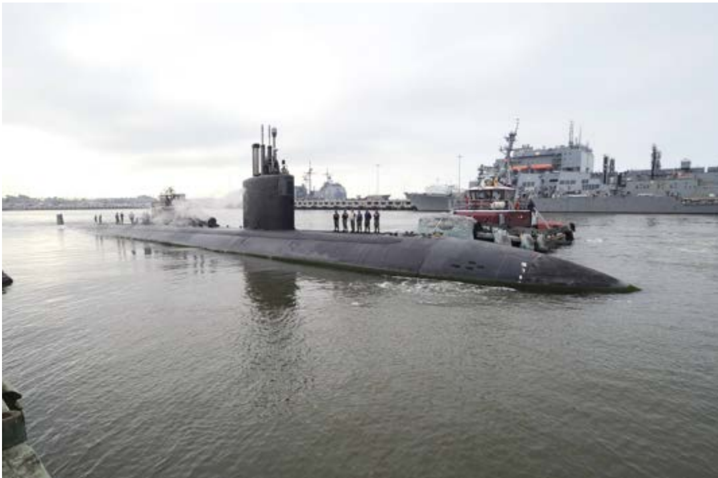
An undated photo of USS Boise (SSN-764).

https://news.usni.org/2024/02/23/navy-awards-attack-sub-uss-boise-1-2b-repair-contract-more-than-7-years-late