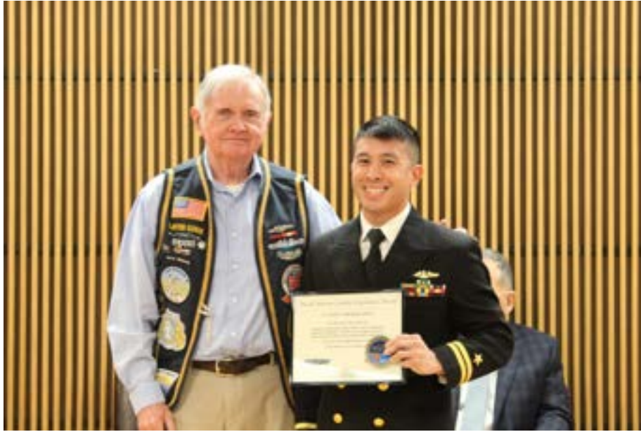
240223 SOAC graduation