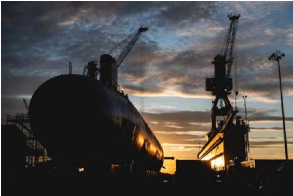
Virginia-class attack submarine Massachusetts (SSN 798) was recently launched into the James River at HII's Newport News Shipbuilding division.

https://www.navalnews.com/naval-news/2024/02/hii-launches-25th-virginia-class-submarine-for-the-us-navy/