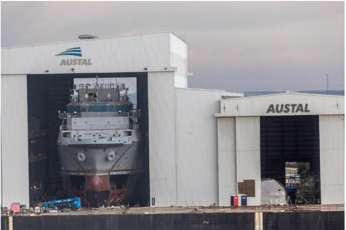
Austal USA's Mobile, Ala., on Aug. 28, 2024.

https://news.usni.org/2024/09/16/austal-usa-awarded-450m-to-build-a-submarine-construction-facility-in-mobile