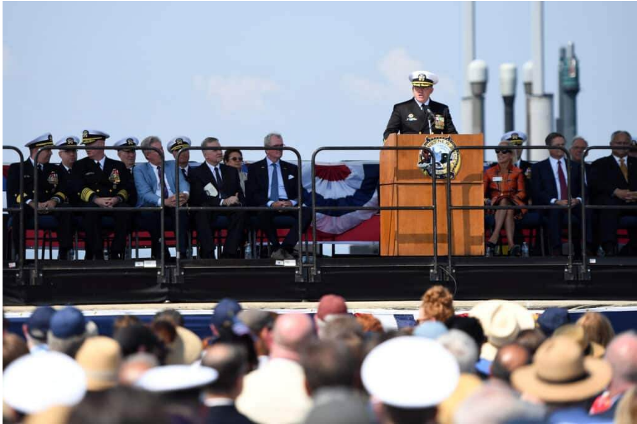
Sailors attached to USS New Jersey (SSN 796) ceremonially man their ship during a commissioning ceremony at Naval Weapons Station Earle, New Jersey on September 14, 2024.

https://www.navalnews.com/naval-news/2024/09/u-s-navy-commissions-virginia-class-attack-submarine-uss-new-jersey-ssn-796/