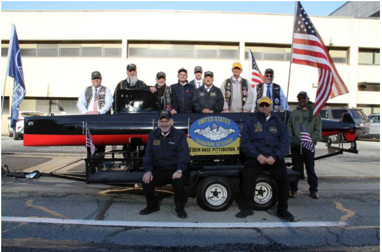
Thank you to all that came out and participated in the Veterans Day parade in downtown Pittsburgh.