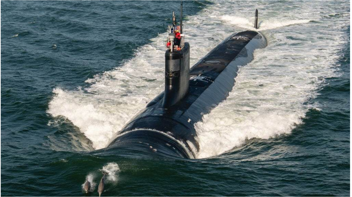
USS New Jersey (SSN-796) during sea trials in 2024.

https://news.usni.org/2024/10/31/hii-fewer-than-2-dozen-shipyard-workers-involved-in-suspect-welds-delay-in-17-sub-contract-creates-unpredictability