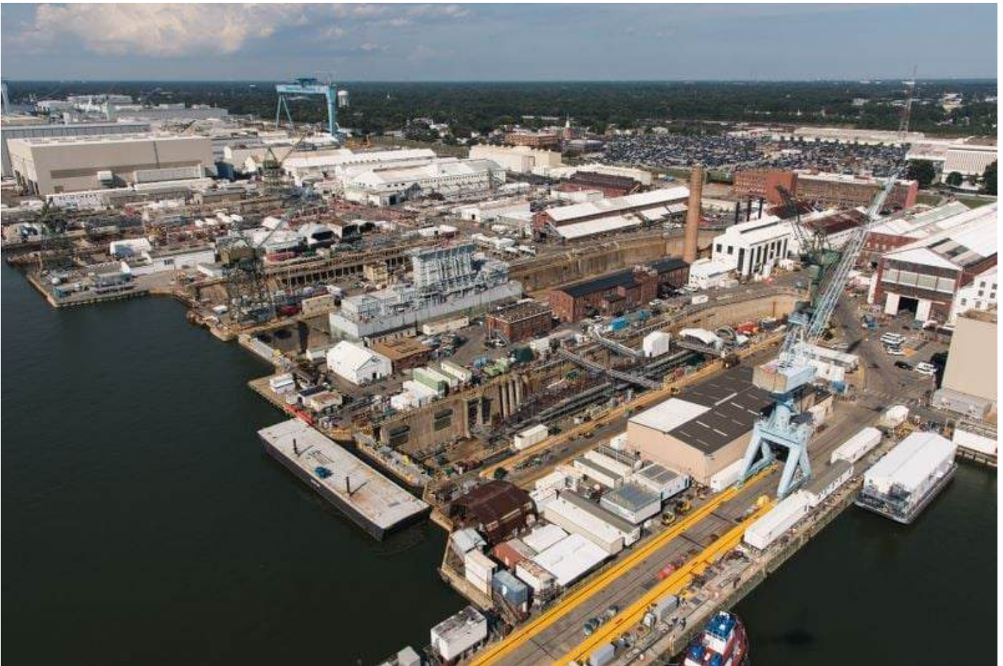
Newport News Shipbuilding on Feb. 19, 2024.

Newport News Shipbuilding builds the bows and sterns of both the Virginia and Columbia-class submarines in a teaming arrangement with prime contractor General Dynamics Electric Boat.